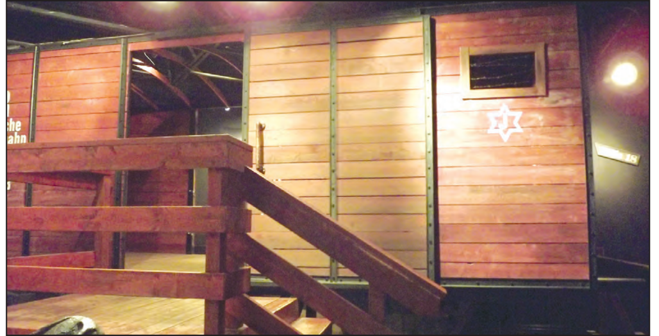
Train car display at the El Paso Holocaust Museum shows the way Holocaust victims were transported from camp to camp.

This "Kinder-Action" (Children's Action) was one of the most brutal murders of hundreds of infants and