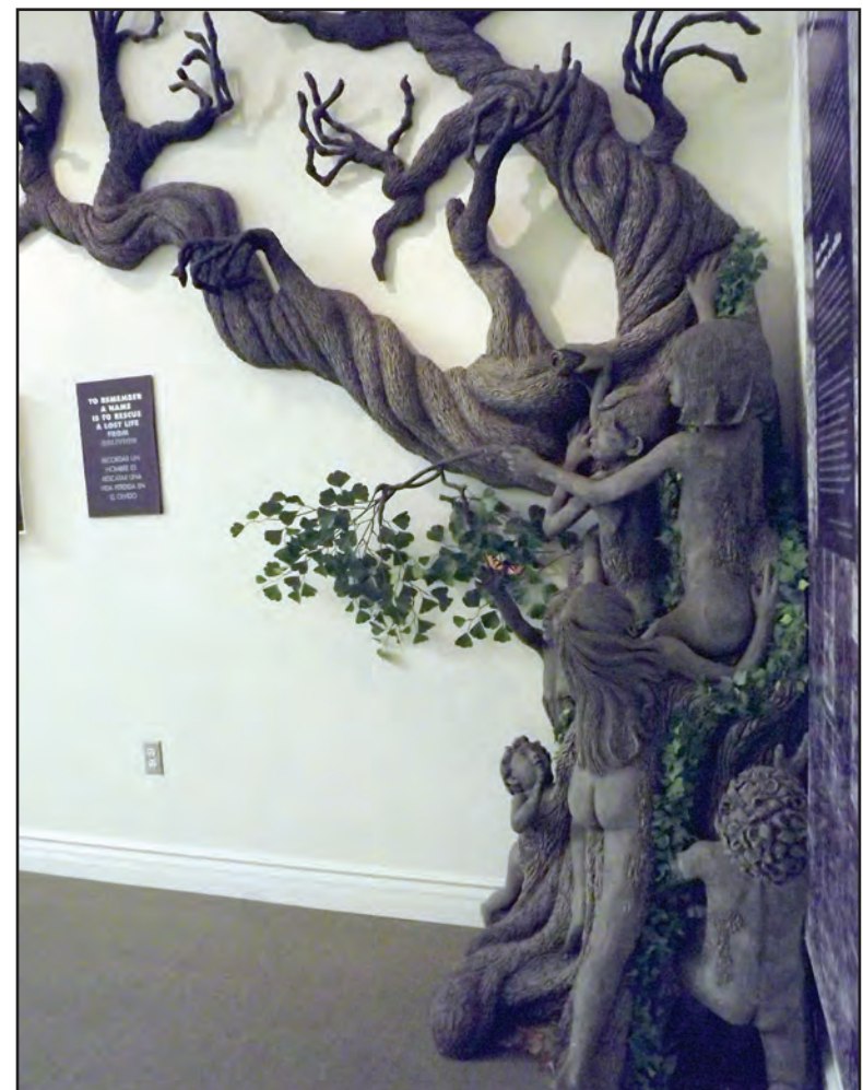
The Tree of Life sculpture in the museum asks visitors to "Remember the Children."